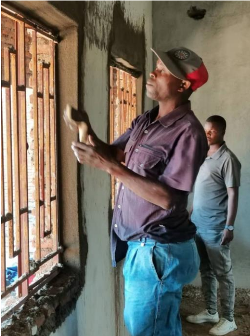
Thanks to extra funding supported by Wilde Ganzen, construction was completed in January.

The ECD in Ngalamo, near Mangochi, is the latest addition to the 5 childcare centres supported by the WoHF. More than 100 children will use this new centre; as a result, they will be better prepared for primary school. The villagers provided land and labour. The school, which will be next to the agricultural site, will also provide housing for a guard/worker on the land. At the end of 2019, in collaboration with Wilde Ganzen, the funds for this Ngalamo project were transferred. Construction started in January 2020; the building came to a complete standstill due to corona; when construction workers could resume work progress was halted by the rising costs and unavailability of materials.